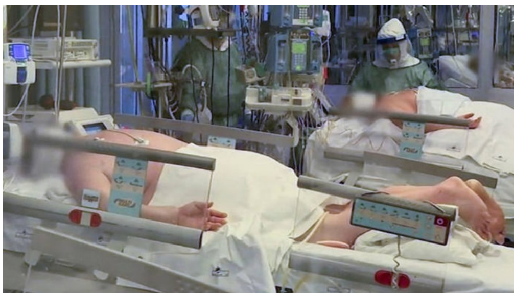
Intensive care unit occupied by COVID-19 patients at Cremona hospital in northern Italy

Second, disasters can also coincide completely independent of each other, which is a risk we are currently facing with the ongoing COVID-19 crisis. In the few months since the start of the COVID-19 pandemic, various disaster types have occurred, including storms, floods and earthquakes. However, we have not seen a major event coinciding with COVID-19 yet this year, which required a large emergency and medical response. Such a disaster could further exacerbate the impacts of COVID-19 on health, economy and societal inequalities and jeopardize the public health response and societal recovery. The deadliest disaster so far was the flood that hit Kenya in March, resulting in 285 lives lost.