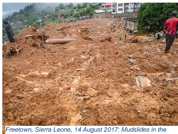
Freetown, Sierra Leone, 14 August 2017: Mudslides in the Regent neighborhood of Freetown, Sierra Leone, where hundreds have lost their lives on 14 August.