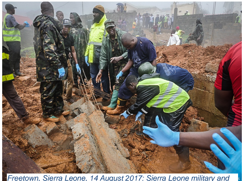
Freetown, Sierra Leone, 14 August 2017: Sierra Leone military and Red Cross volunteers are clearing rubbles, looking for survivors. Rescue teams lack adequate equipment and bad conditions are putting them at risk.