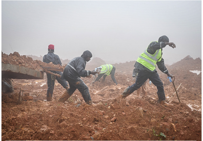
Freetown, Sierra Leone, 14 August 2017: Rescue teams are digging through the mud and debris, looking for survivors.